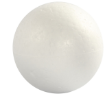
Polystyrene Balls, 8 cm, White, 5 pc 543080