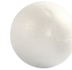
Polystyrene Balls, 10 cm, White, 5 pc 543100